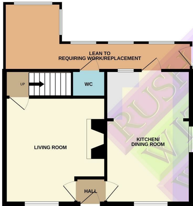
GROUND FLOOR 518 sq.ft. (48.1 sq.m.) approx.